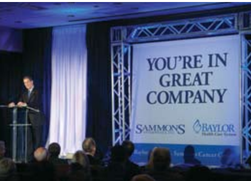
Baylor Health Care System is in great company with Sammons Enterprises.