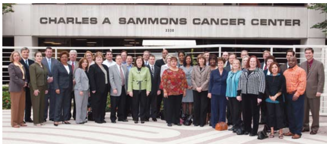
Employees of Sammons Enterprises Inc. in front of the Baylor Charles A. Sammons Cancer Center

Plans for the new Baylor Sammons Cancer Center were unveiled in September 2008. It will