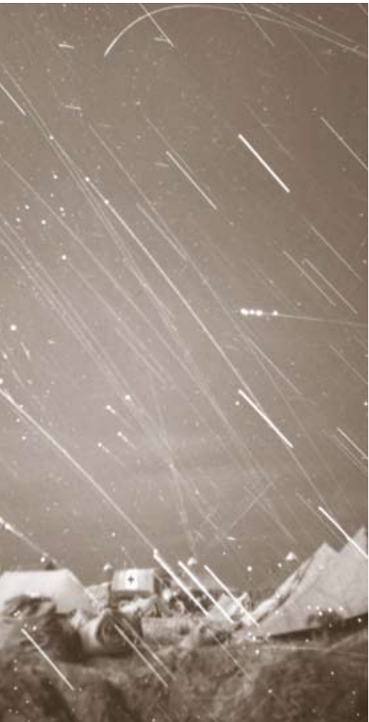
The 56th Evacuation Hospital under fire at night during the fighting at Anzio in 1944.

I n August of 1940, as Europe suffered from the Axis onslaught, the leadership of Baylor University Hospital received a fateful telegram. They were asked to organize a medical unit for the United States Army. Our doctors and nurses met the challenge in true Baylor fashion: they formed the 56th Evacuation unit (also known as the "Fighting 56th"). They trained diligently before shipping out to a combat zone that would lead them from the battle strikes in North Africa to the invasion of Italy. The Fighting 56th served as a tent hospital providing medical services for more than 73,000 wounded and dying soldiers. While serving in Italy, the Fighting 56th lost personnel during the continual bombardment from enemy forces. Because of the frequent shelling of the hospital, patients were known to go AWOL, preferring the relative safety of the front lines. Day and night, without ceasing, the Fighting 56th worked. The wounded, the shattered, the dying would be treated and moved, then replaced by more wounded and shattered and dying. It was an experience to haunt the best of men and women. One of Baylor's nurses, Lt. Mary Roberts, became the first woman in history to receive the Silver Star for bravery. In July of 1945, the unit was awarded the Meritorious Service Unit plaque for "superior performance of duty in the accomplishment of exceptionally difficult tasks." Please take a moment to remember the brave men and women of the Fighting 56th.