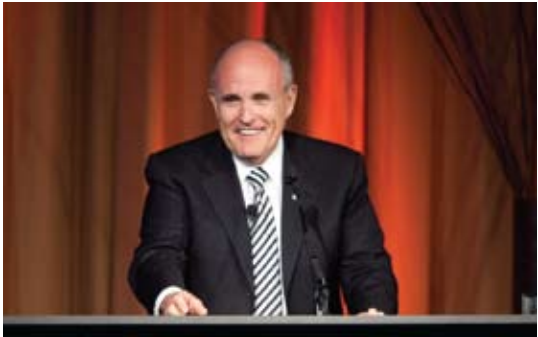
Former New York City Mayor Rudy Giuliani

EveryMan® benefits prostate cancer research, education, community outreach and expanded technology throughout Baylor Health Care