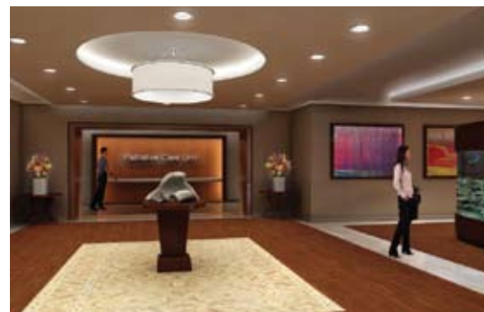
A digital rendering of the new lobby of the palliative care center in Collins Hospital