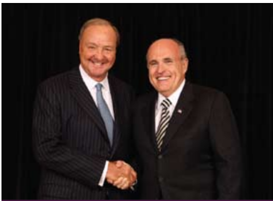
Thomas O. Hicks and Rudy Giuliani