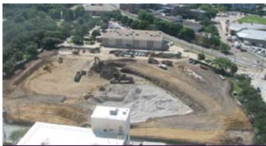
Follow the cancer center construction. Visit www.newcancercenter.com to see the latest developments.