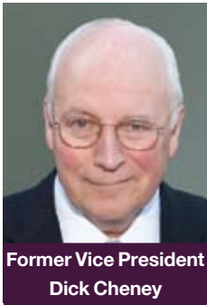
Former Vice President Dick Cheney

Cheney has had numerous cardiovascular episodes, beginning with his first heart attack when he was 37 years old.